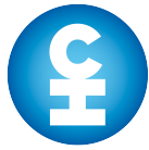
Table of Contents – Energy Storage in the Northeast United States